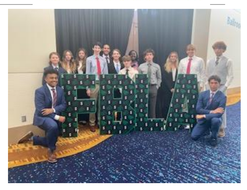
District Fall Rally 10/28/2022