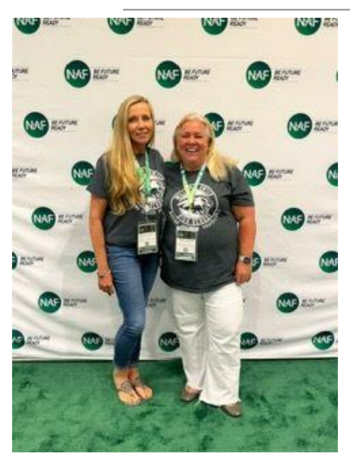
NAF Conference - Dallas