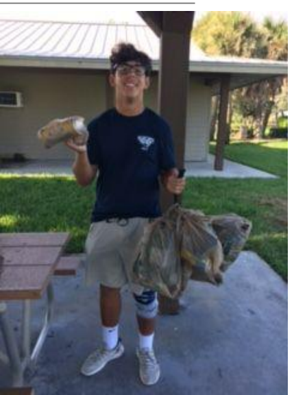
Young Friends of Jupiter Beach - Ocean Cay Park