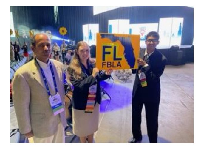
National Leadership Conference-Chicago