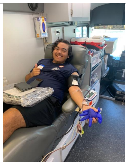
These students are saving up to 3 lives!

Our Blood Drive Committee hard at work! We sponsor blood drives on campus and the funds from One Blood are used to award scholarships to seniors in the Dwyer Academy of Finance program.